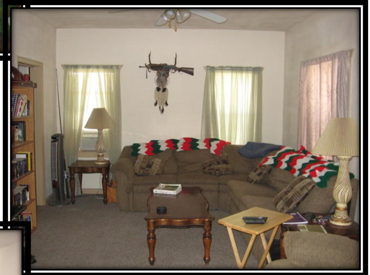
On Main Level