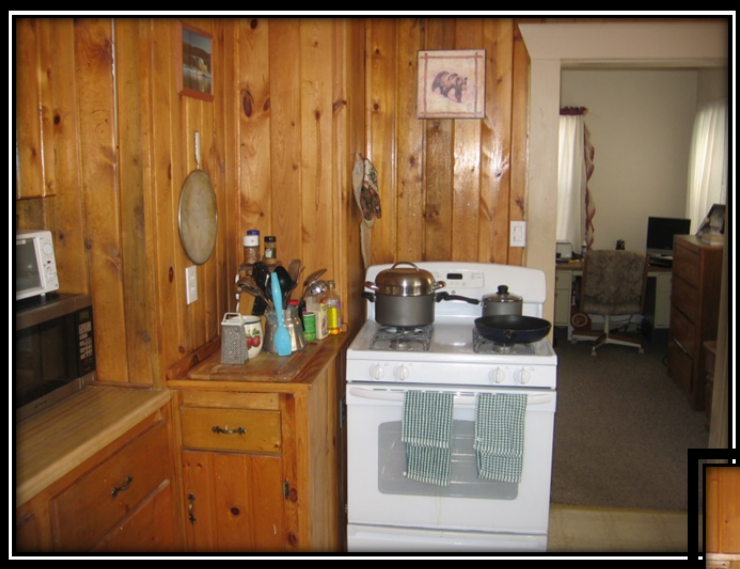
Kitchen On Main Level