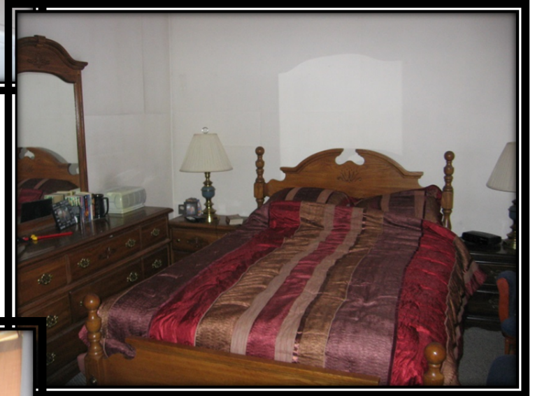
Bedroom on Main Level