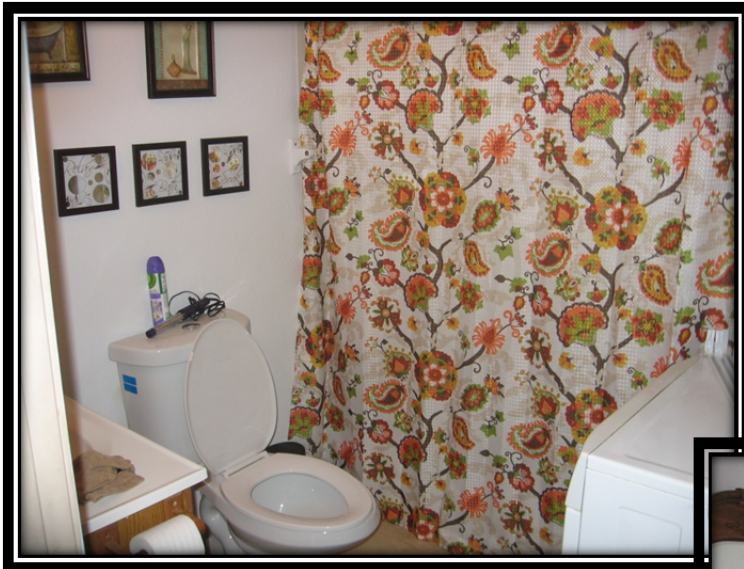
Bath on Main Level